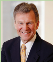
Tom Daschle Former Senate Majority Leader