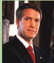
Bill Frist Former Senate Majority Leader